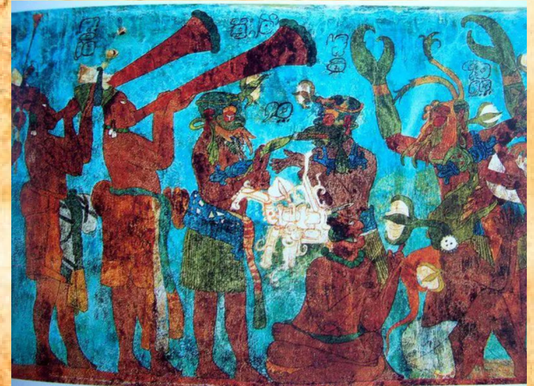
*Tambores Códice Madrid

The wind instruments, one of the most important for the Mayan culture, ocarinas and clay flutes, create sounds of birds, frogs and the jungle, transporting us to the magical and mysterious Mayan world.